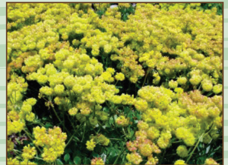
Kannah Creek Sulfur Flower