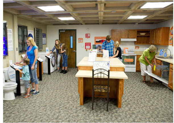
Tour our indoor exhibit during our regular business hours.